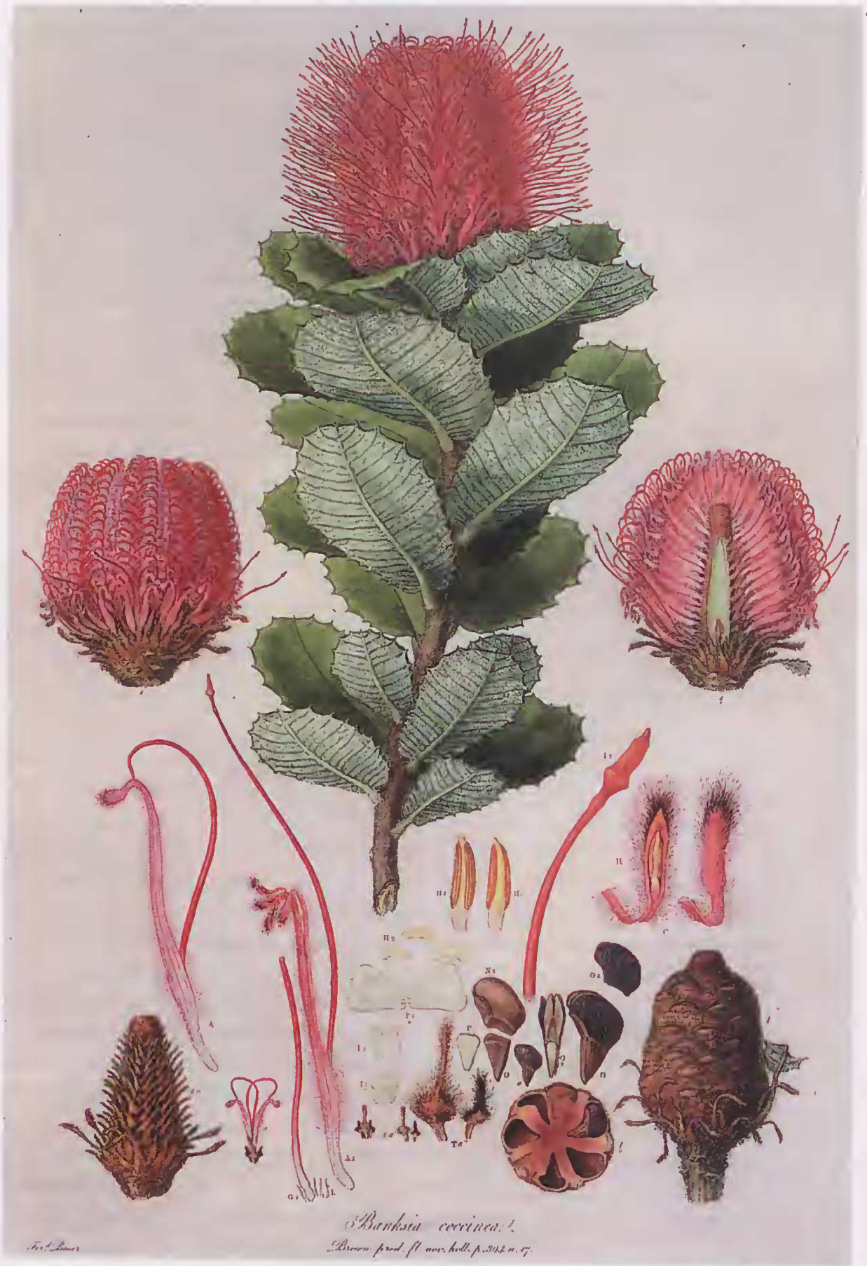
Figure 1. Banksia coccinea drawn by Ferdinand Bauer from a specimen collected at King George Sound, Albany, on the south-western coast of Australia.